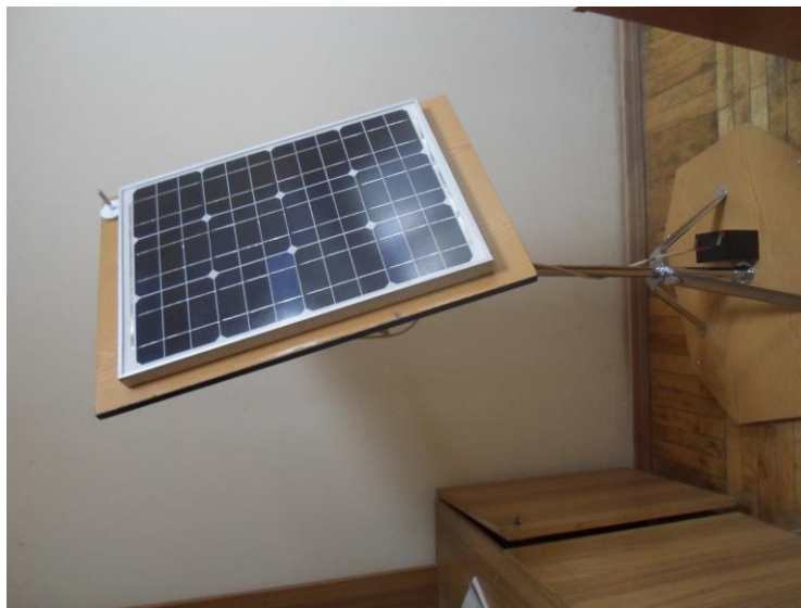
Fig. 2. Technical parameters of solar panels

On the basis of the carried research it is proposed to conduct a comprehensive assessment of environmental safety based on the current organizational structure of the environmental monitoring and information model by involving specially formulated environmental indicators and indices of quality.